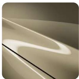
Zircon Sand Metallic