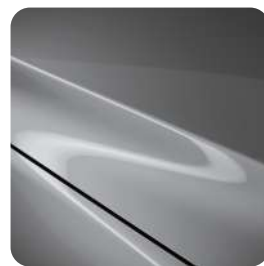
Aero Grey Metallic