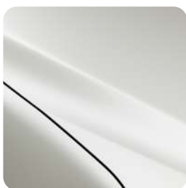
Rhodium White Premium