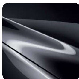
Machine Grey Metallic