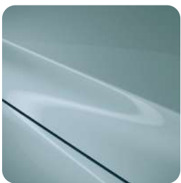
Air Stream Blue Metallic