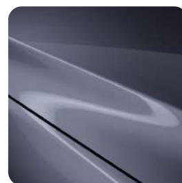
Polymetal Grey Metallic