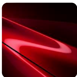
Soul Red Crystal Metallic