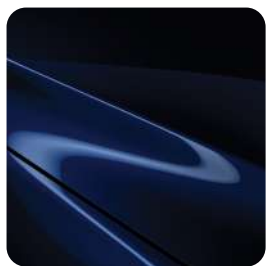
Deep Crystal Blue Mica