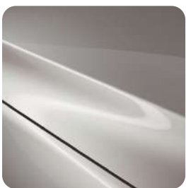
Platinum Quartz Metallic